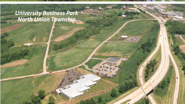
University Business Park North Union Township