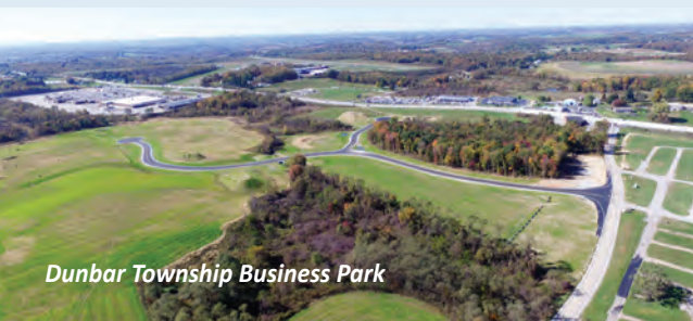
Dunbar Township Business Park

- KOZ TAX-FREE SITES - KIZ DESIGNATED SITES