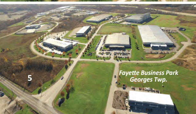
Fayette Business Park Georges Twp.