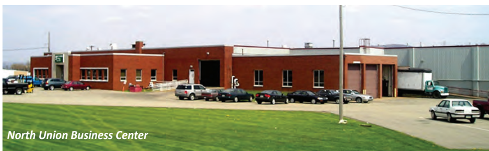
North Union Business Center