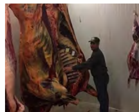
2016: May's Custom Meat Processing