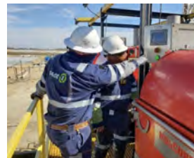
2011: BOS Rentals (Now Stage 3 Separation)