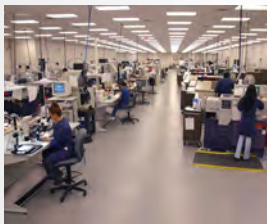
2008: Johnson Matthey