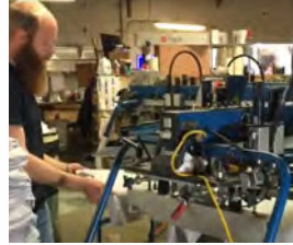
1995: Ohioyle Prints