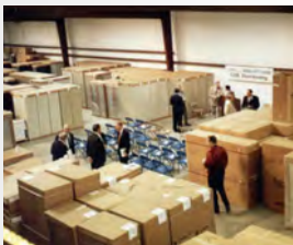
2018: COE Distributing