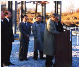
1998: Dynamic Materials, Inc. (DMC)