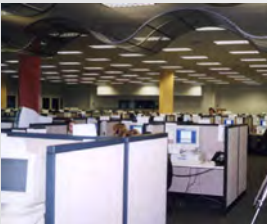
1997: TeleTech Customer Service