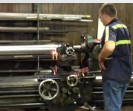
2012: ZRM Enterprises