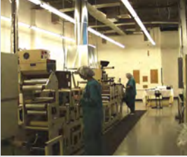
1992: Berkley Surgical