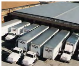
2009: Pittsburgh-Fayette Express, Inc.