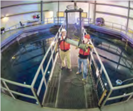
2002: ST Productions/SenSyTech (Now Argon ST, a Boeing Company)