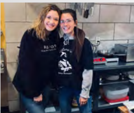
2017: Ruvo's Italian Restaurant