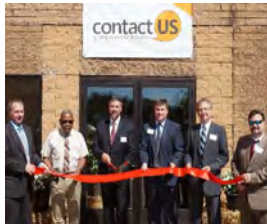
1999: CallTech (Now ContactUS)