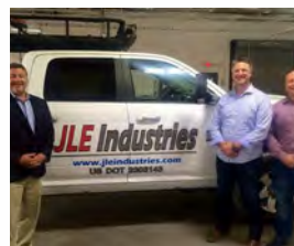
2015: JLE Industries