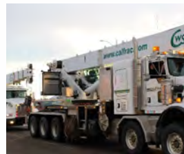
2010: Calfrac Well Services