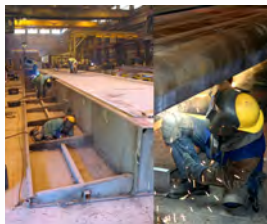
2019: Heartland Fabrications