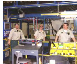
2005: Hunter Panels