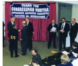
2000: Advanced Acoustic Concepts