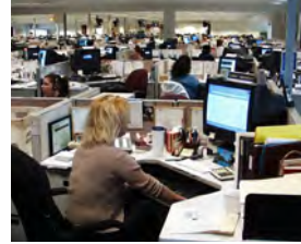
1997: Columbia Gas Service Center (NiSource)