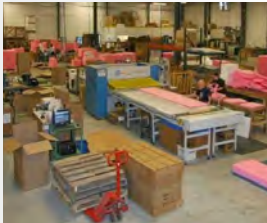
2003: PSI Packaging Services, Inc.