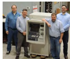
2020: George R. Smalley Electric Co.