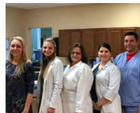
2021: Mongtomery Medical