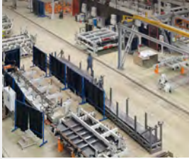
1993: Ball Transfer Systems, Inc.