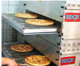
2004: MF&B Restaurant Systems (now Edge Ovens)