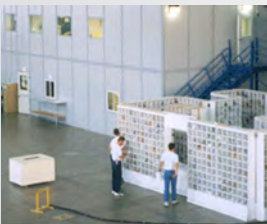
2007: Ebtech Industrial