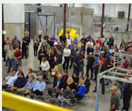
2013: Gerome Manufacturing Co., Inc.