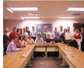
2006: Parametric Technology Corp. (now PTC)