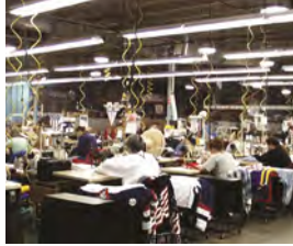
1994: Stahls Hotronix