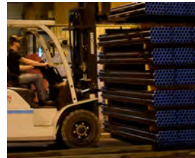
2001: Speciality Conduit & Mfg.