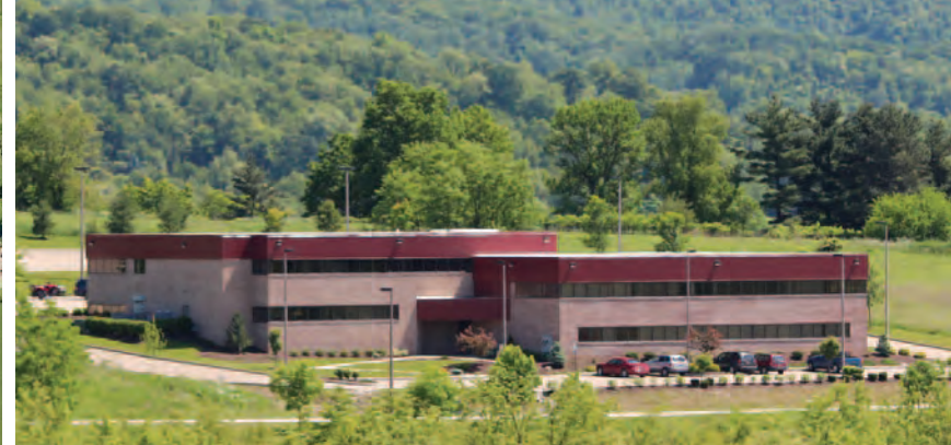
Eberly Business Center, University Business Park, North Union Twp.