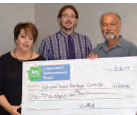
Community Reinvestment Fund Check Presentation to the National Road Heritage Corridor