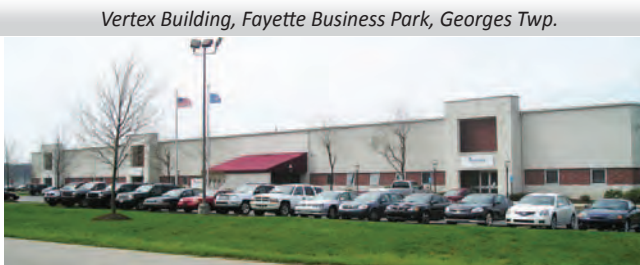
Vertex Building, Fayette Business Park, Georges Twp.