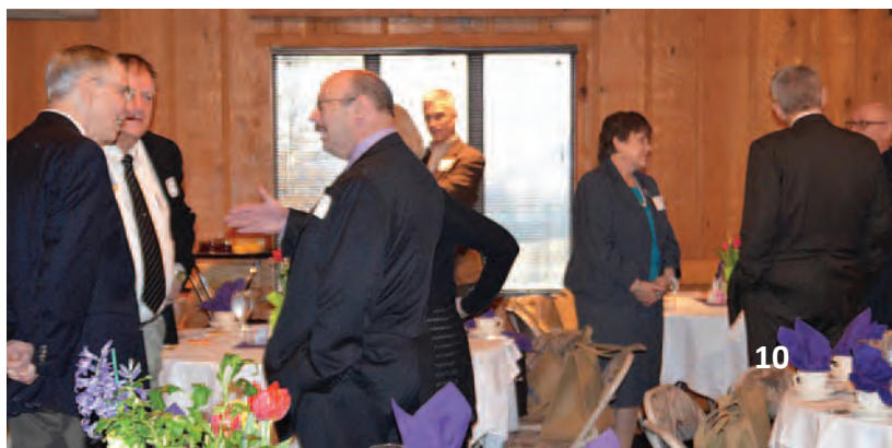
Bankers' Breakfast Event

Fay-Penn awarded $6,968 in Community Reinvestment Fund grants. The Fund derives money each year from the Fay-Penn annual meeting auction to be awarded to local non-profits for projects such as playground improvements, after school programs, children's reading programs and more.