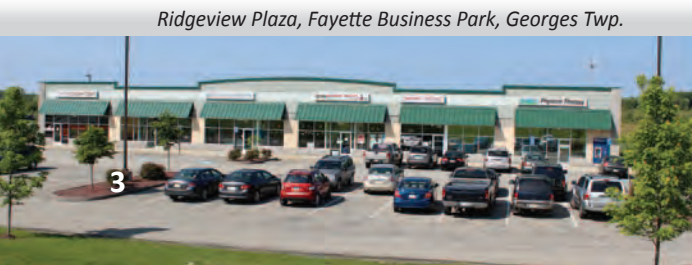
Ridgeview Plaza, Fayette Business Park, Georges Twp.