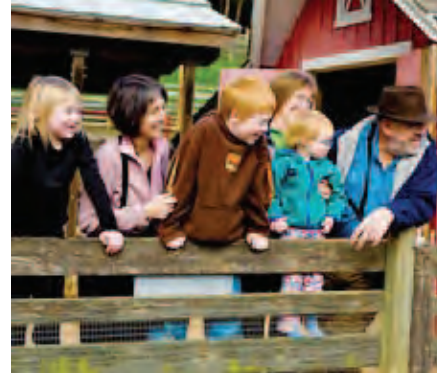
Fay-Penn supported local agriculture by conducting weekly farmer's markets at various locations throughout the County