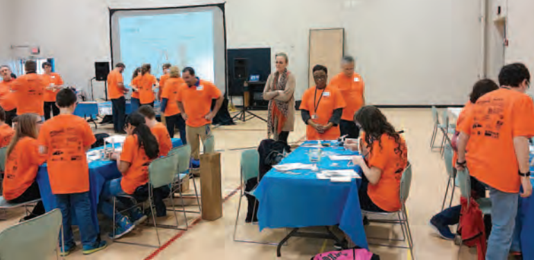
NFPA Fluid Power Challenge Event at Penn State Fayette - The Eberly Campus