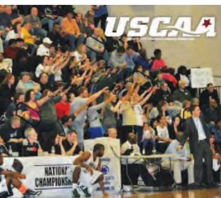
USCAA National Basketball Championship held at Penn State Fayette - The Eberly Campus