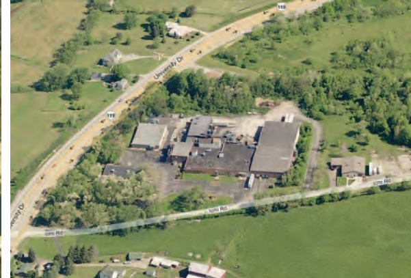
119 ICM Road Business Center, Dunbar Twp.