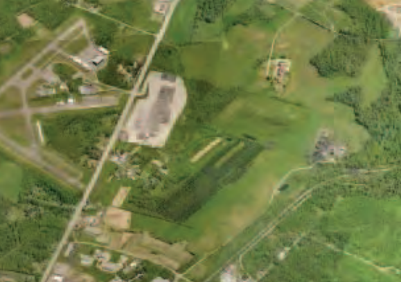
Dunbar Township Business Park, Dunbar Twp.