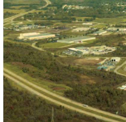
Fayette Business Park, Georges Twp.