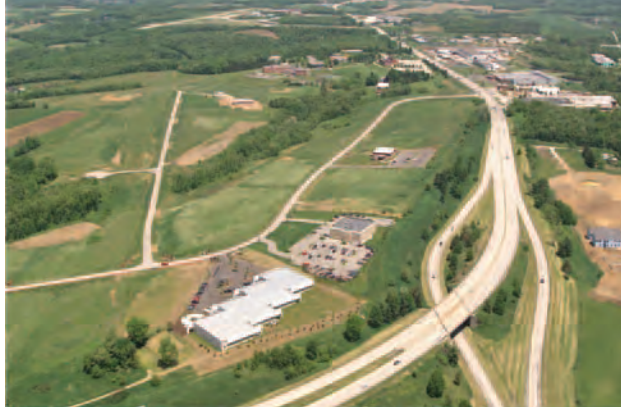
University Business Park, North Union Twp.