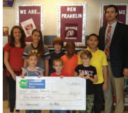
Community Reinvestment Fund Check Presentation to Ben Franklin Elementary School for new playground equipment