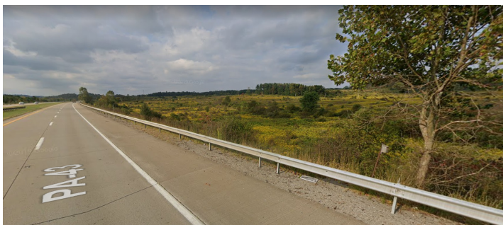
View from PA 43 - Looking South