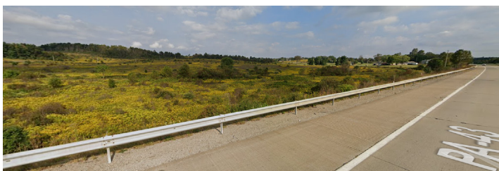
View from PA 43 - Looking North